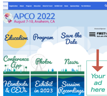
Example is from APCO 2022 website.